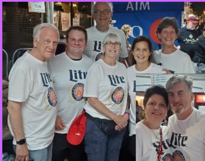
Naperville Last Fling