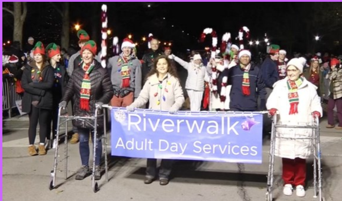
Naperville Parade of Lights