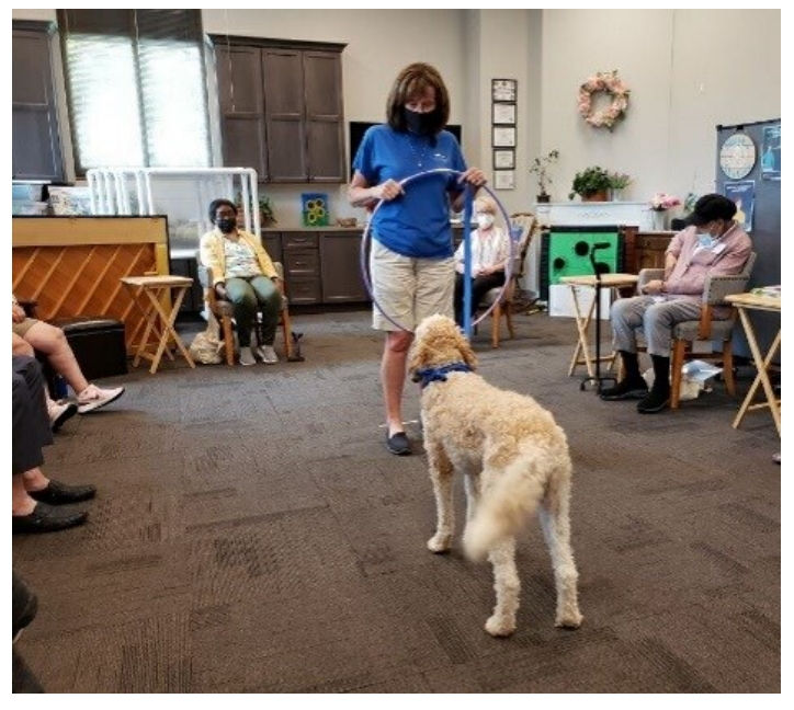
Duke the Therapy Dog

We were excited to have Duke return to our program. Duke is a 3-year-old therapy dog that preforms tricks and interacts with the participants.